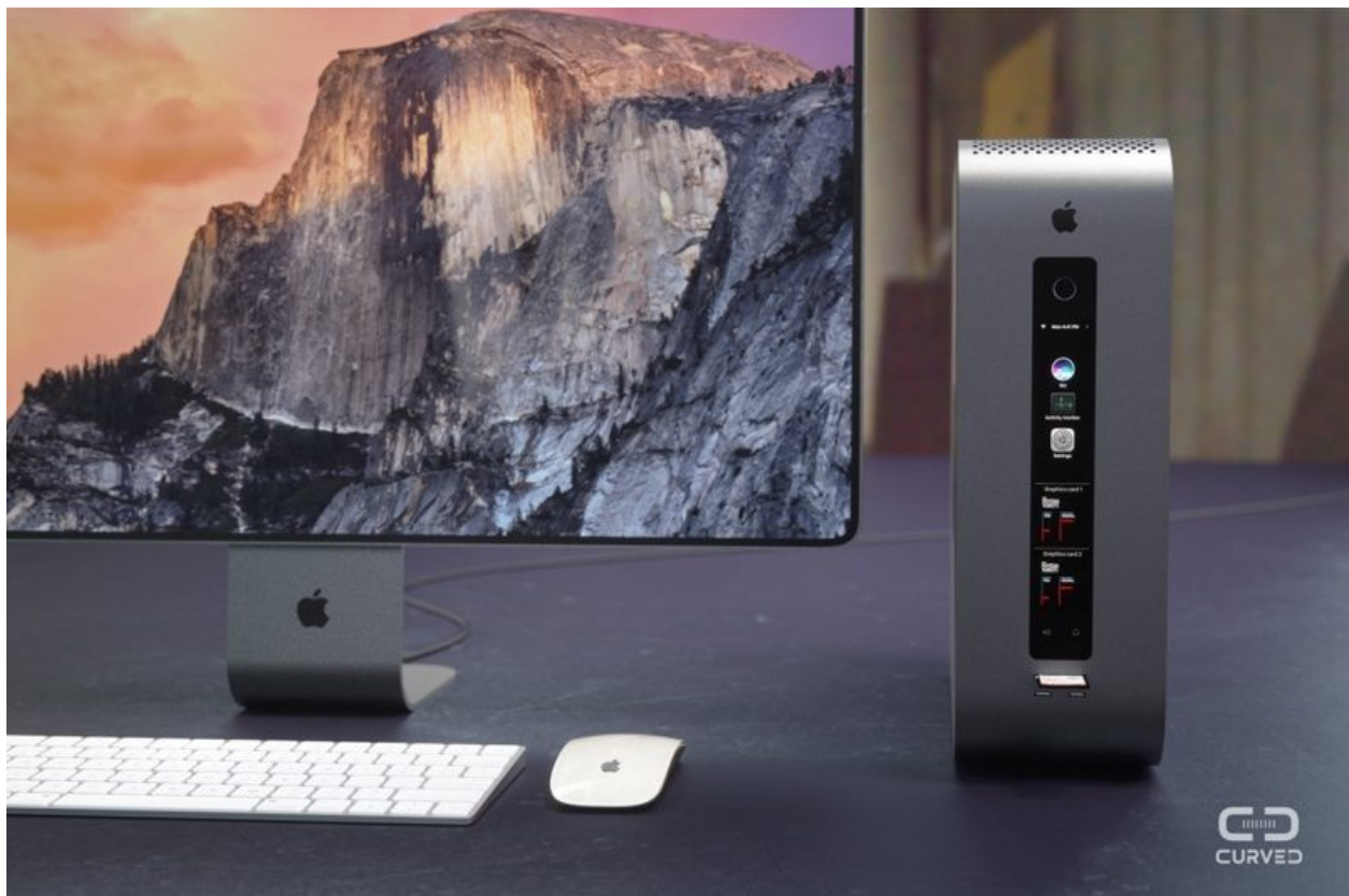
Modular Mac Pro concept from Curved.de

Apple announced the revamp in 2017, but said that it wouldn't be finished until 2019. Apple is committed to making the upcoming Mac Pro the highest-end Apple desktop system available, allowing it to accommodate VR and high-end cinema production.