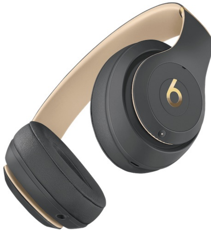
Apple's Beats Studio over-ear headphones

To accompany the AirPods and the HomePod, Apple is rumored to be developing a set of high-end over-ear headphones that will be Apple branded rather than Beats branded.