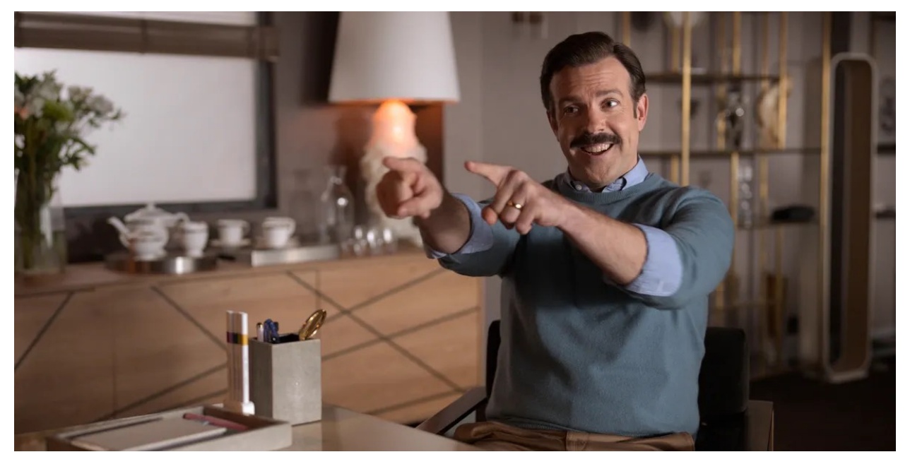
Ted Lasso, a fish-out-of-water sports dramedy, has been one of Apple TV Plus' most popular shows. Apple

Lastly, if you can, take advantage of the Apple One bundle -- which lets users combine different services like Apple Music, Apple Arcade, Apple News Plus, storage service iCloud and the new Apple Fitness Plus for one price. By subscribing to Apple One, you can try Apple TV Plus free for one month.